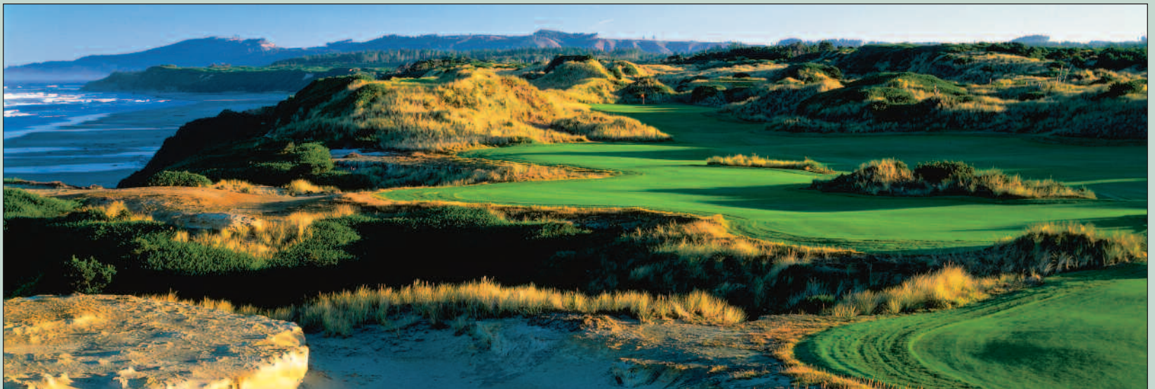
Golf Digest's "America's 100 Greatest Courses" Biennial list that includes both public and private courses: Pacific Dunes - #14 Bandon Dunes - #31