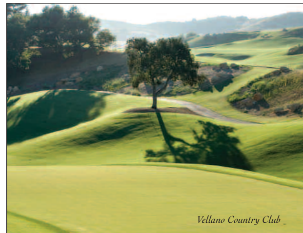
Vellano Country Club

Within the confines of Vellano Country Club exists the first Greg Norman Signature Golf Course in the Los Angeles metropolitan area.