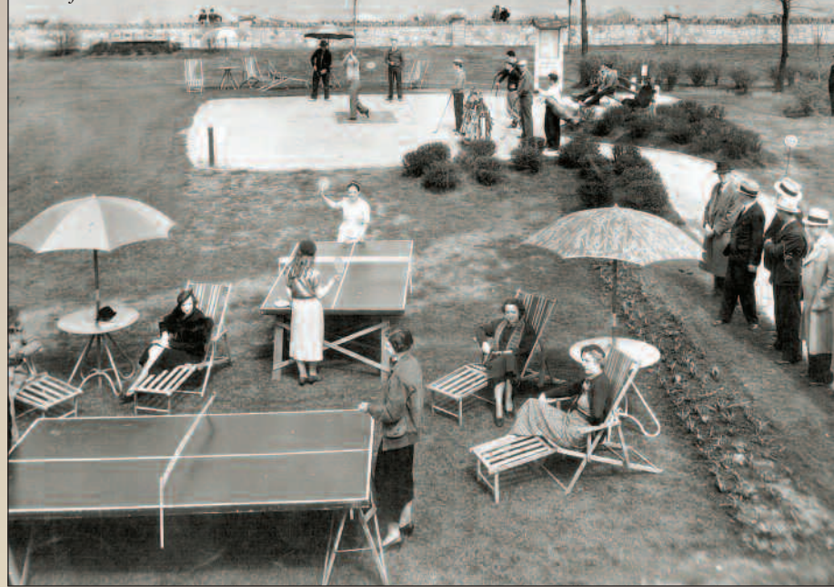
1930s fun at Waveland.

Since 1993, KemperSports, manager of Marovitz and several other golf courses, driving ranges and learning centers that comprise the Chicago Park District golf portfolio, has overseen continuous renovations and capital projects to improve course conditions and playability, including the installation of grass tees at Marovitz. In 2003, Marovitz was designated as a Certified Audubon Cooperative Sanctuary by Audubon International for its commitment to environmental stewardship.