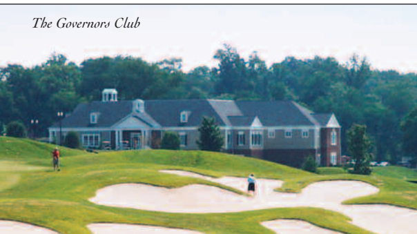
The Governors Club

KemperSports has been chosen by Oaktree Capital Management, a Los Angeles-based investment management firm, to operate three select private clubs designed by three professional golf and course-architecture icons.