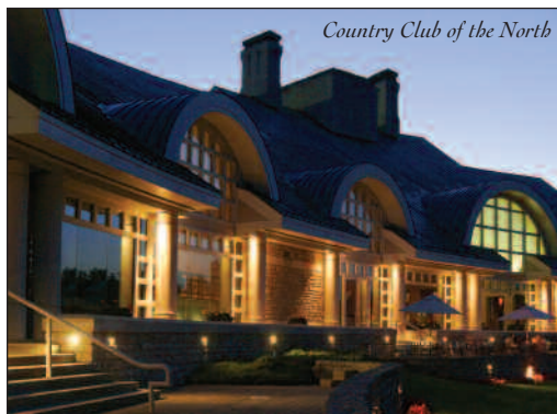
Country Club of the North