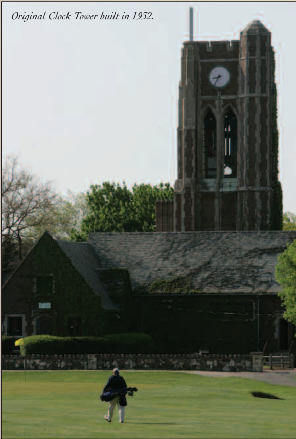
Original Clock Tower built in 1952.

Despite the original construction struggles, the course – nestled along Lake Michigan in Chicago's Lakeview neighborhood – has hosted more than 4.2 million rounds since its opening in 1932.