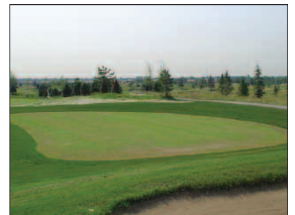
The Glen Club unveiled a new Tom Fazio-designed practice facility in April. This project was undertaken in conjunction with Northwestern University, whose men's and women's golf teams will share the new green and bunker complex as one of their primary practice facilities.